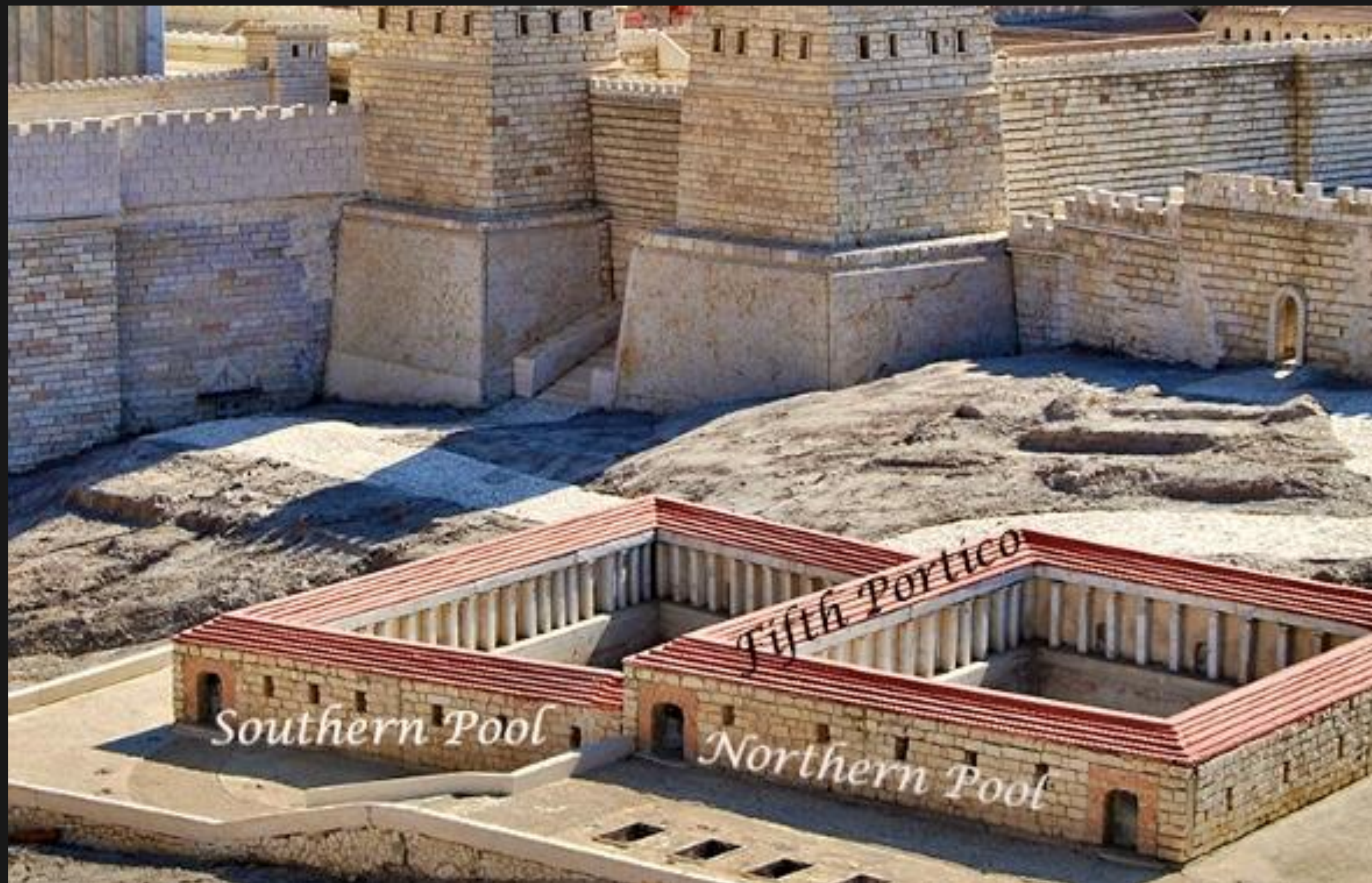
Photo of a model of Jerusalem 70 A.D.