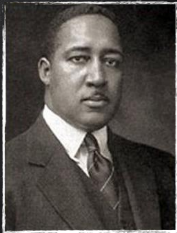
John Wesley Work III