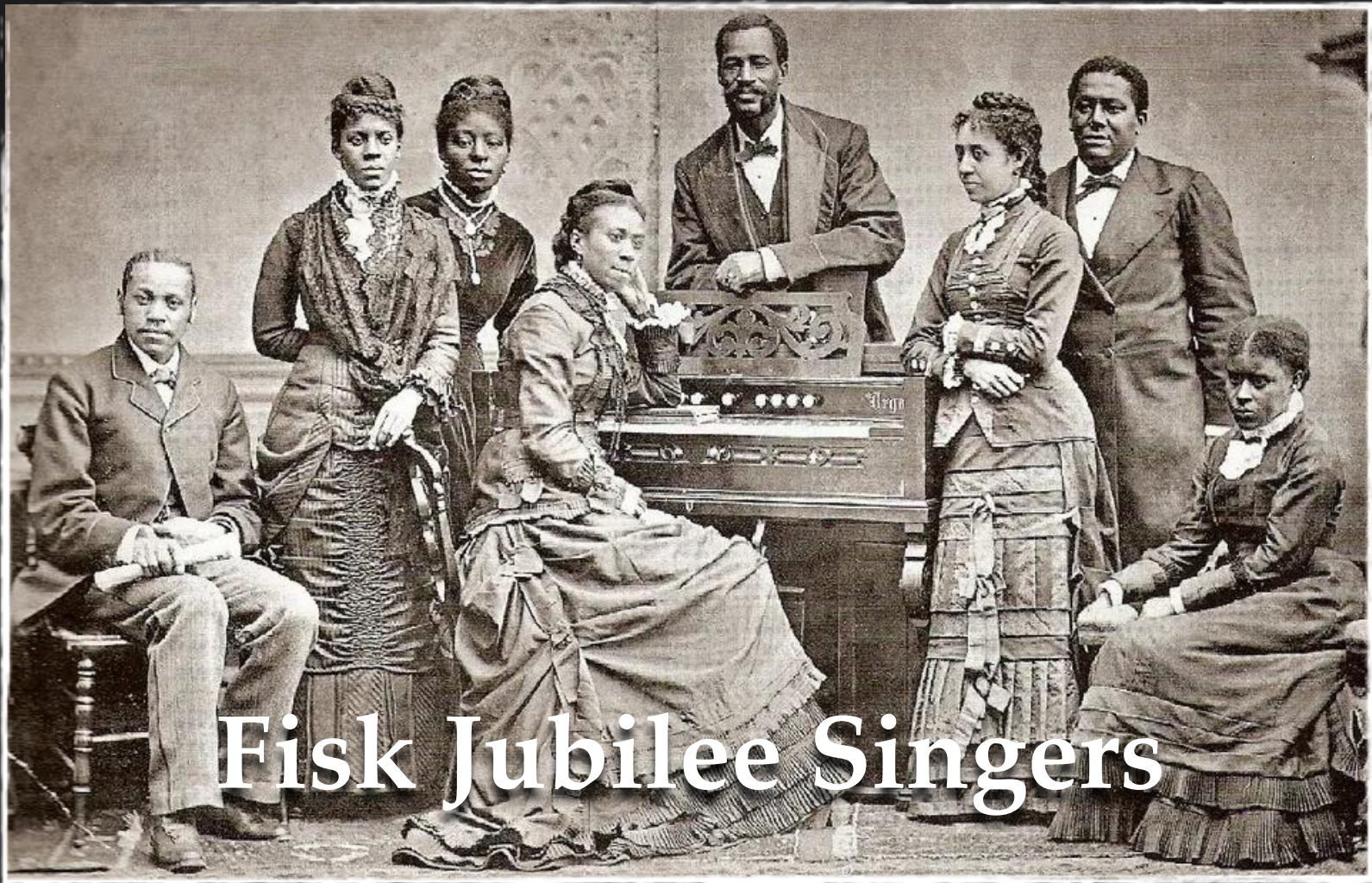
Fisk Jubilee Singers