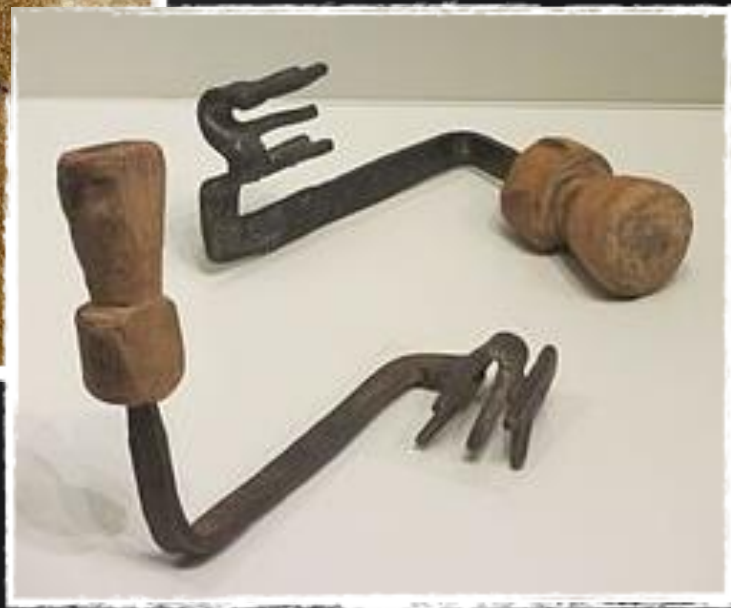
Lock & Keys