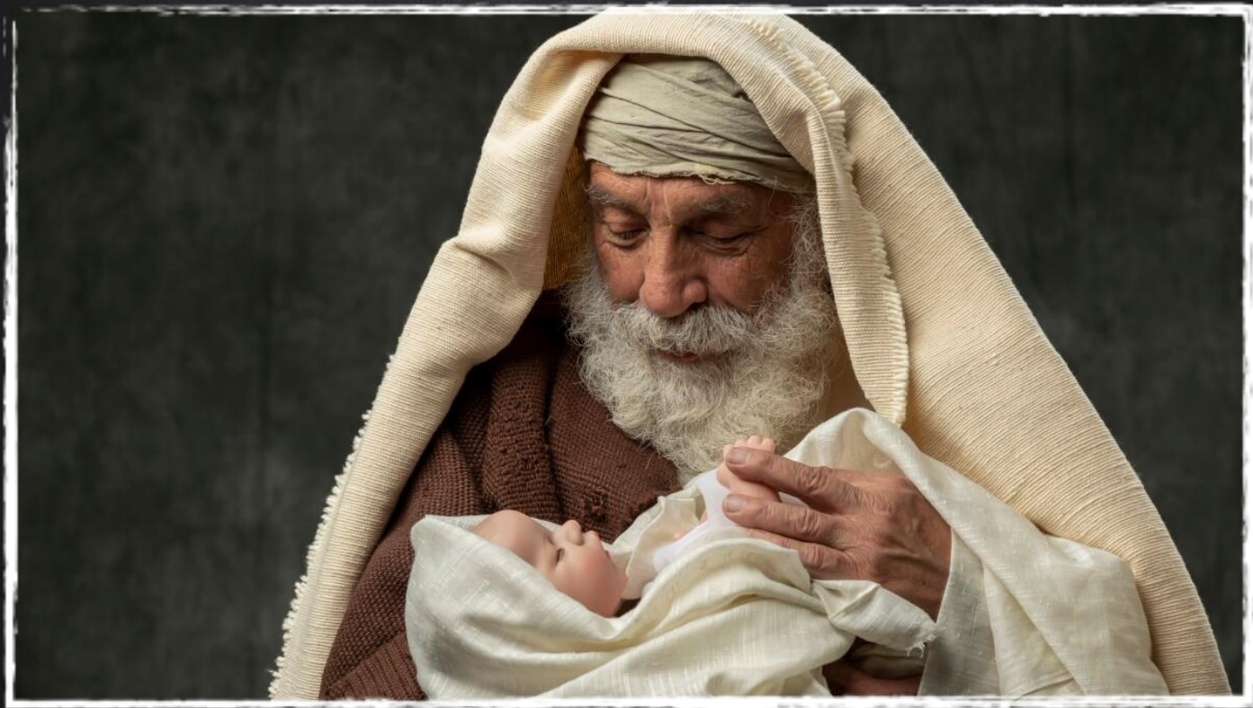
Simeon in the Temple