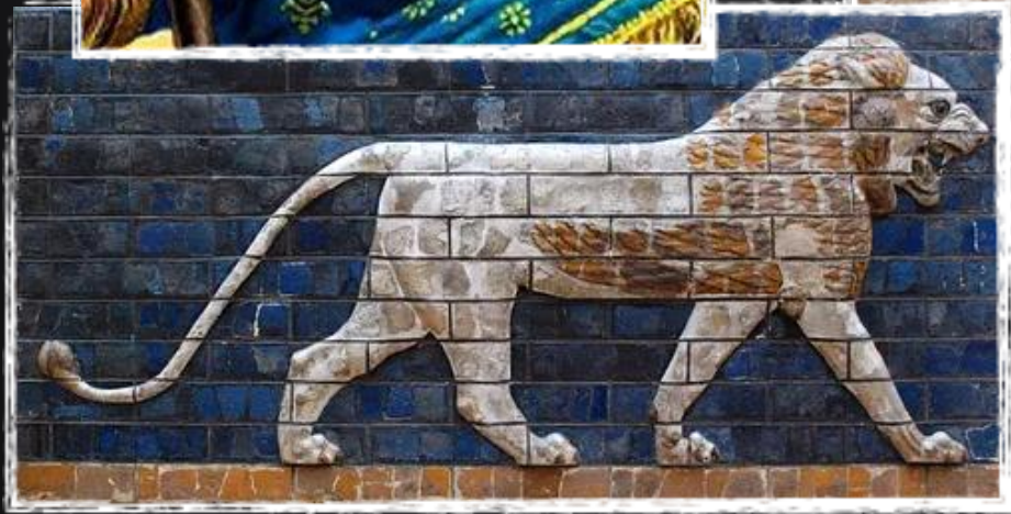
Nebuchadnezzar II Neo-Babylonian Emperor (605 BC - 562 BC)