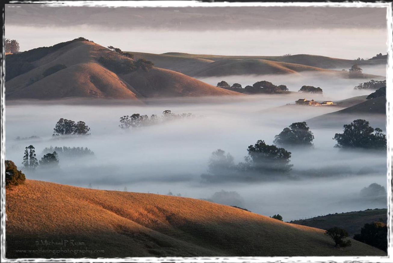
Petaluma, "the land of little hills"