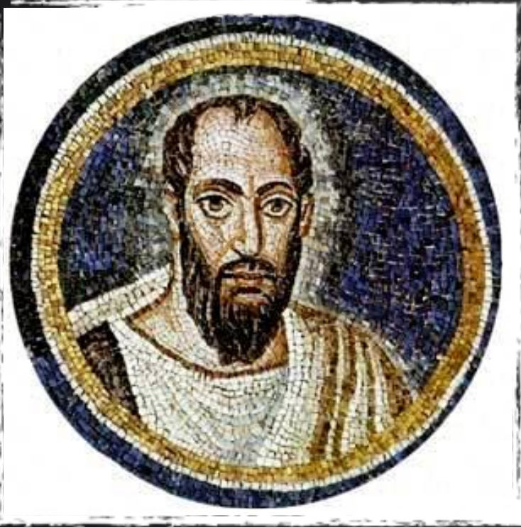
Saul of Tarsus